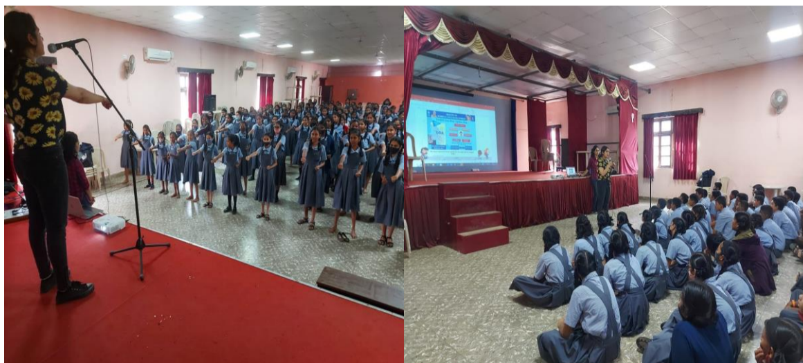
Figure 18 Awareness Programme along with Self Defence Workshop at St. Cruz High School, St. Cruz

After the workshop, a faculty of the school proposed the vote of thanks for conducting the programme and creating awareness among the children. The session was a fruitful one as the children actively participated and it seemed that they understood the instructions very well and would follow the same. The programme ended with a group picture with the CRC banner in background. The programme ended at 11 am.