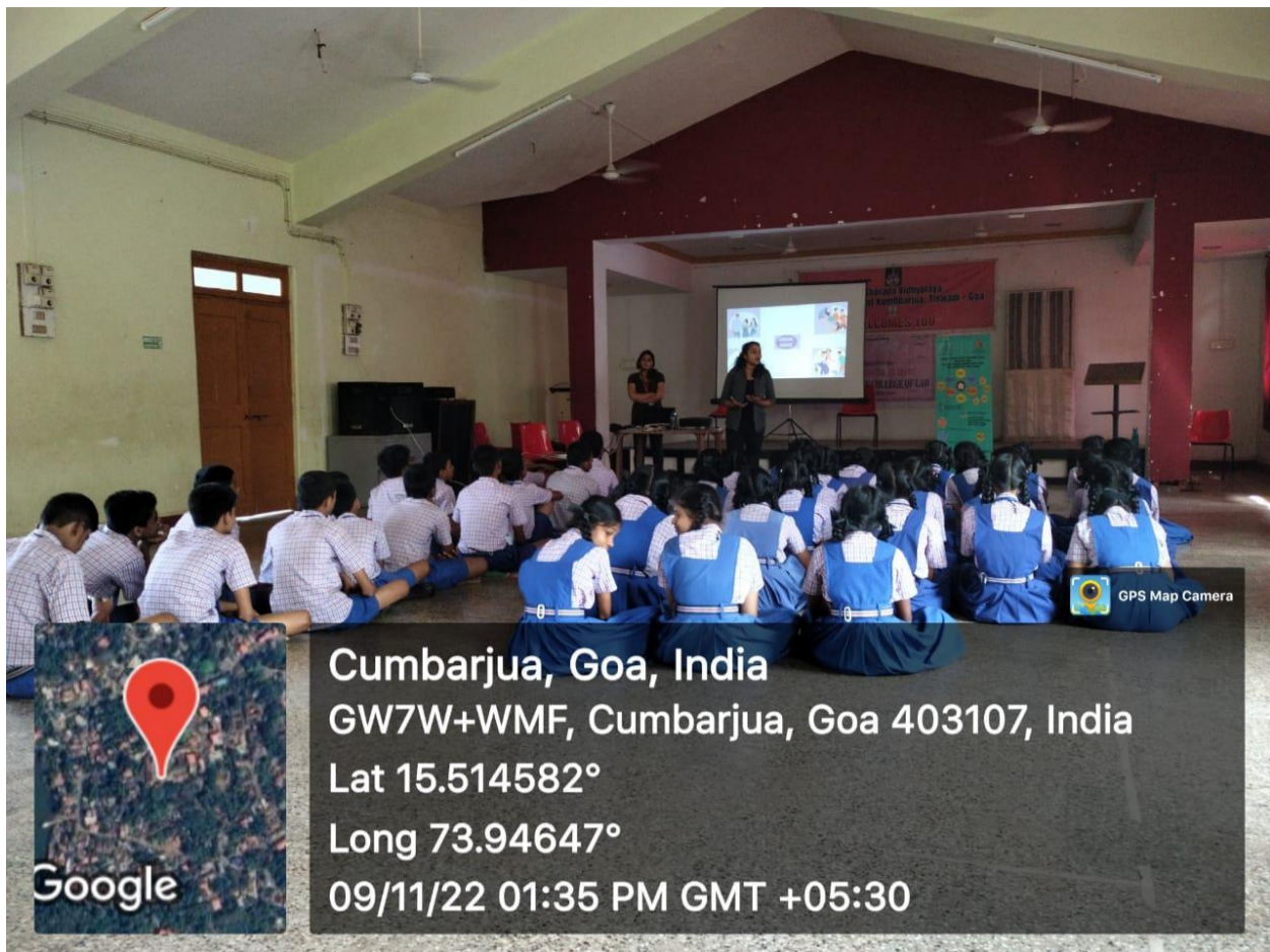
Figure 15 CRC program at S. S. V. Government High School in Cumbharjua, Goa