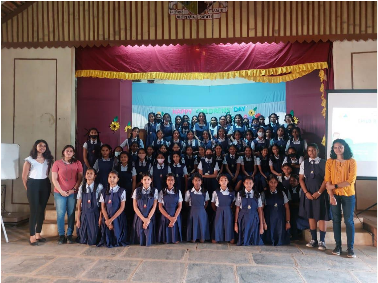
Figure 17 Awareness Program at St. Joseph's School, Arpora