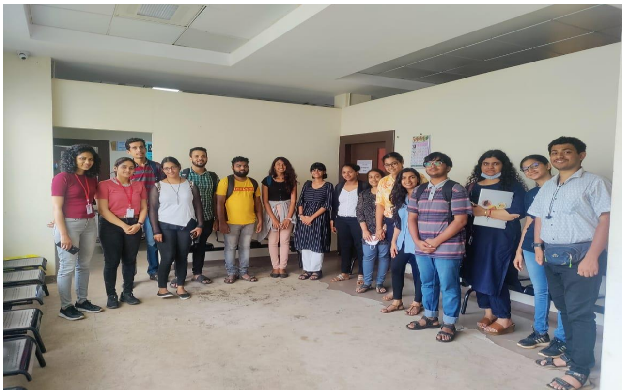
Figure 1 ICRC members visit to SCAN- VAU

There was a presentation and briefing given to the student members of the Child Rights Clinic to provide an idea of how the NGO works and a brief insight into how VAU& OSC functions and assists the victims and the cases they deal with were given by NGO members. The presentation documented and encapsulated all of the work done by SCAN and the services they provide. The hosts were very accommodating and patiently answered all queries of the students. Overall, it truly was a very informative and insightful visit for the members of the Clinic.