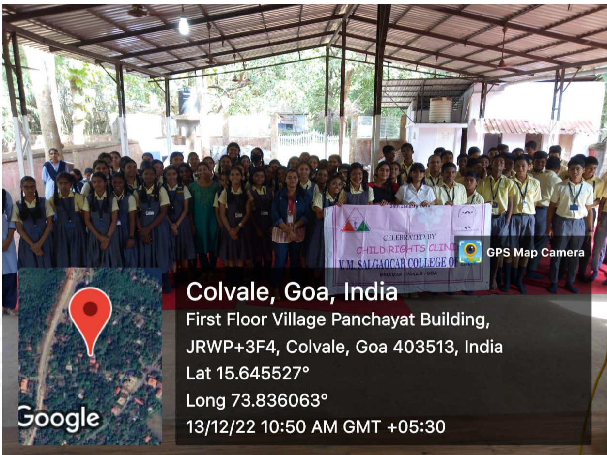
Figure 20 Program at Colvale