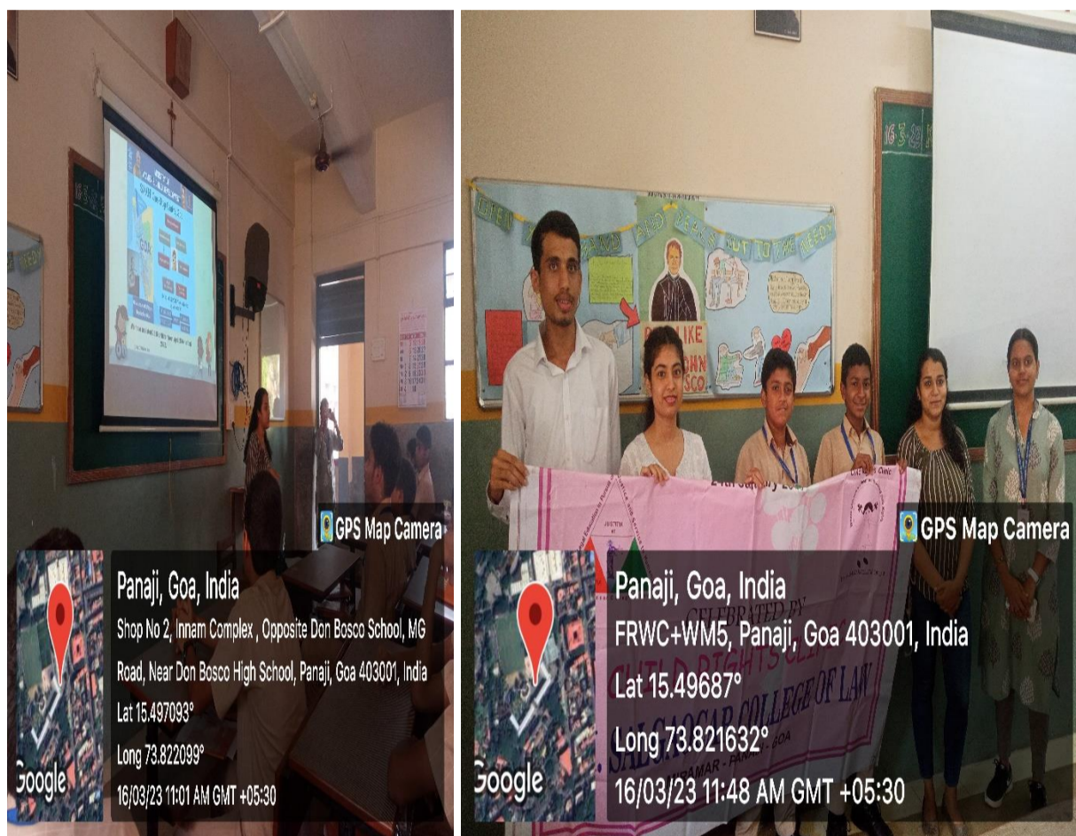
Figure 25CRC program at Don Bosco High School in Panaji.

In conclusion, the program was considered to be informative and helpful by the attendees. The event successfully raised awareness about the importance of protecting children from abuse and equipped participants with essential skills for self-defense..