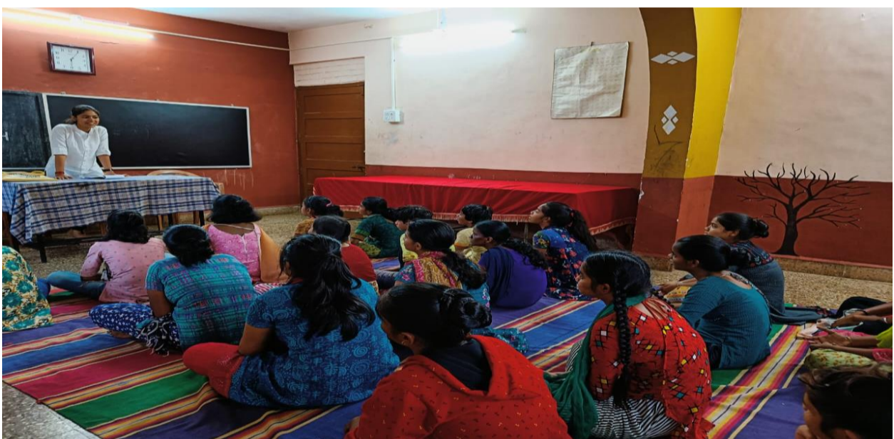
Figure 26 Programs on Child Rights and Juvenile Laws at Ponda