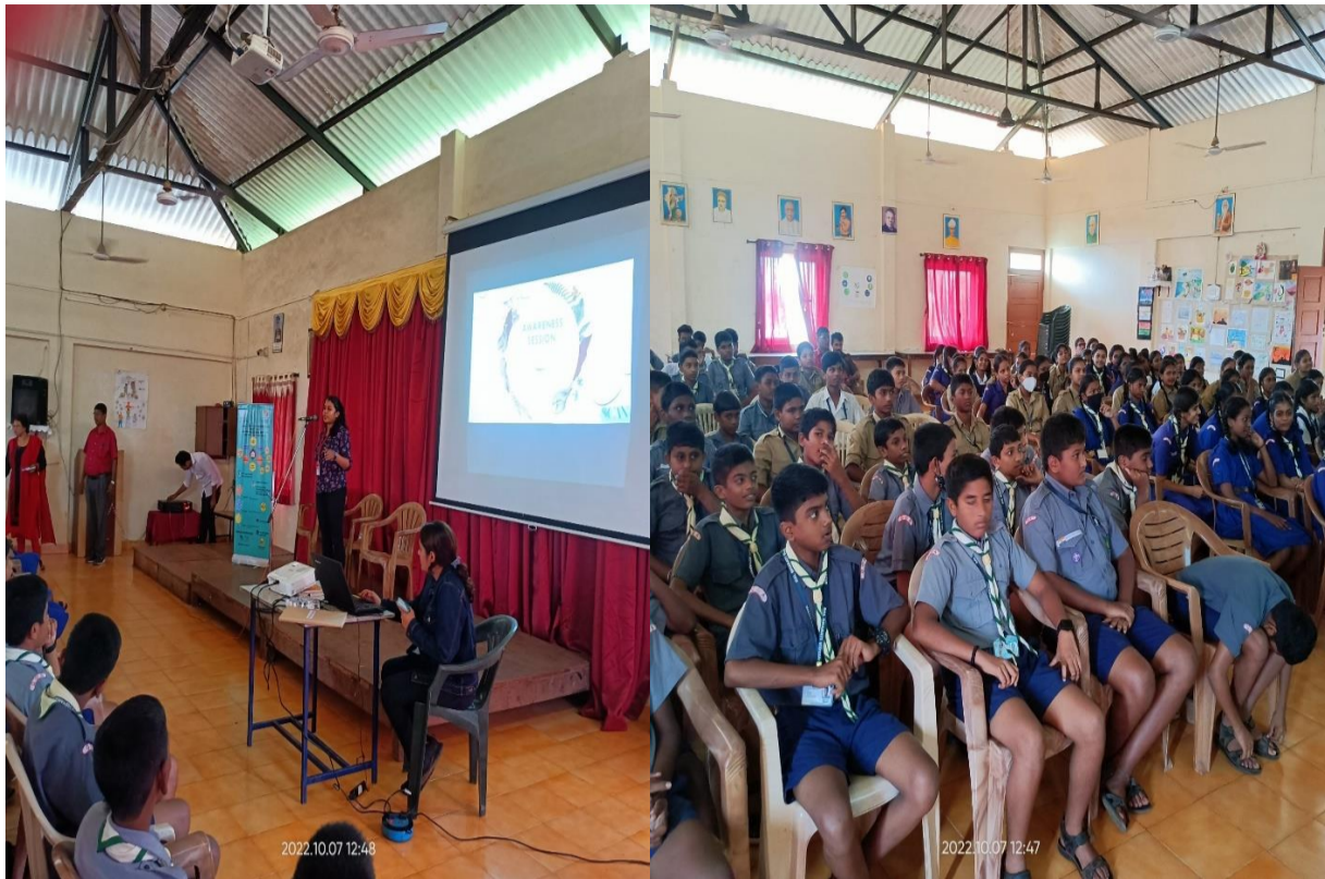
Figure 5 Awareness program at Bal Bharati School on child helpline