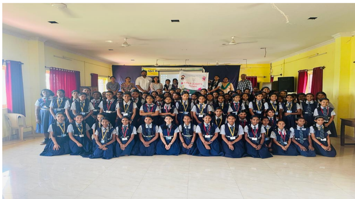
Figure 27 program conducted at Dayanand Arya school Neura.