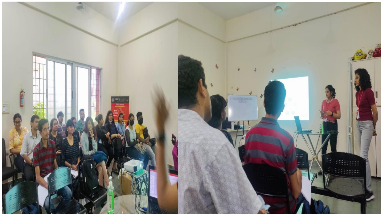
Figure 2 Briefing session by SCAN