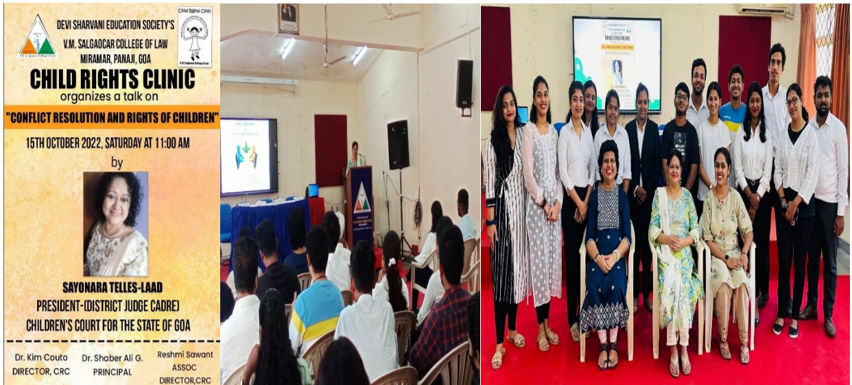
Figure 8 conflict resolution and rights of children talk