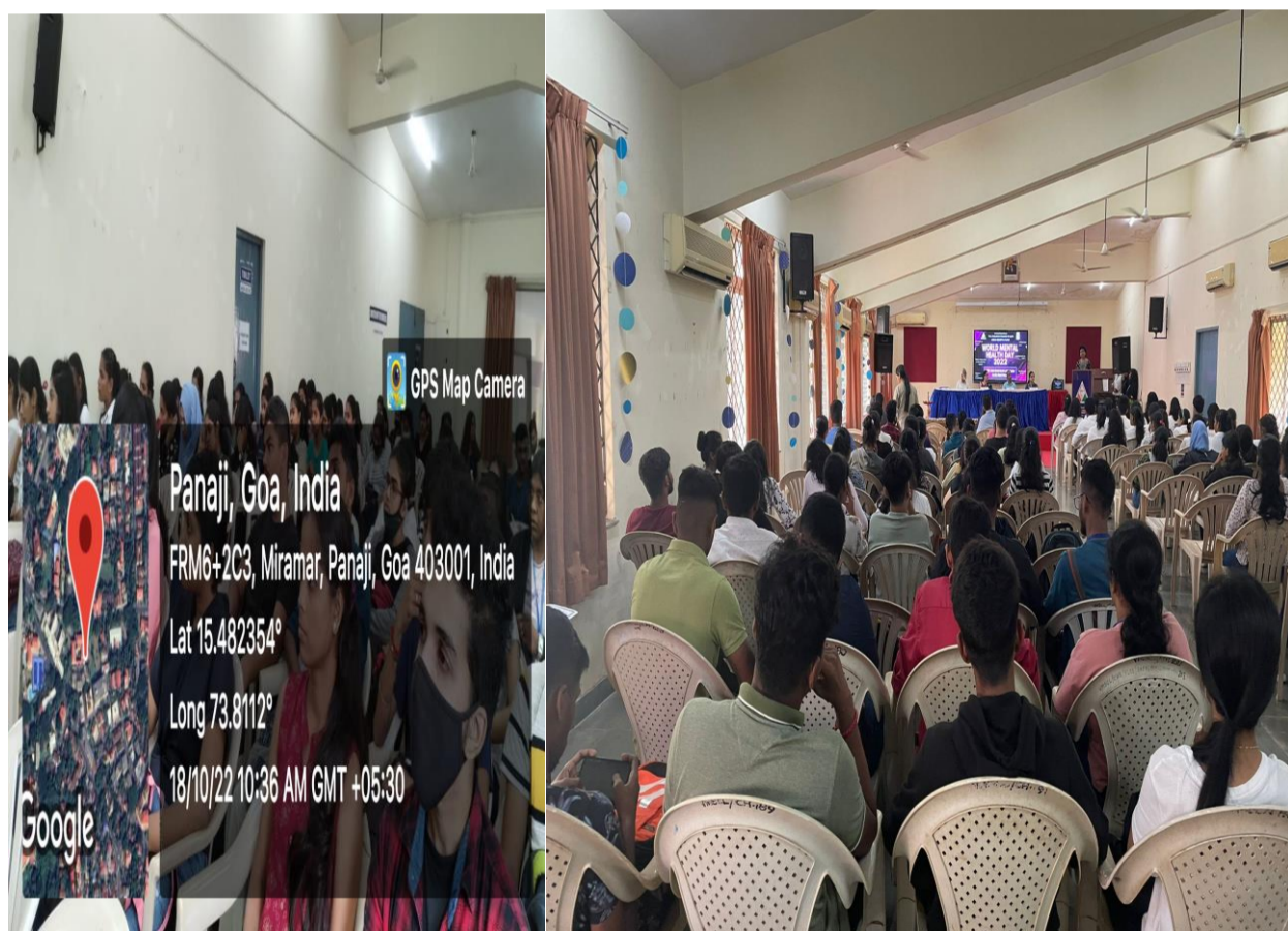
Figure 10 Mental Health Program at VM Salgaocar College of Law

The vote of thanks was proposed by Dianne and the event concluded after photographs of all the CRC members, certificate course participants and the dignitaries were taken.