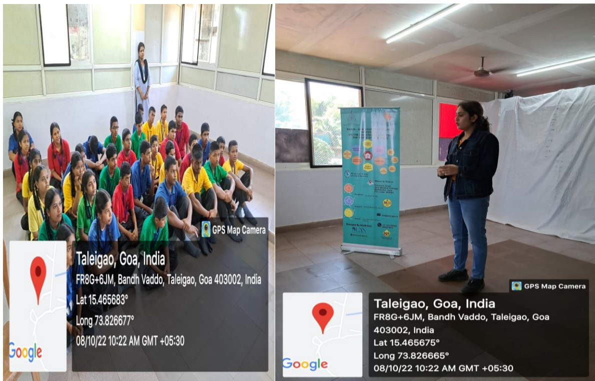
Figure 6 Awareness program was conducted at Royale School located in Taleigao