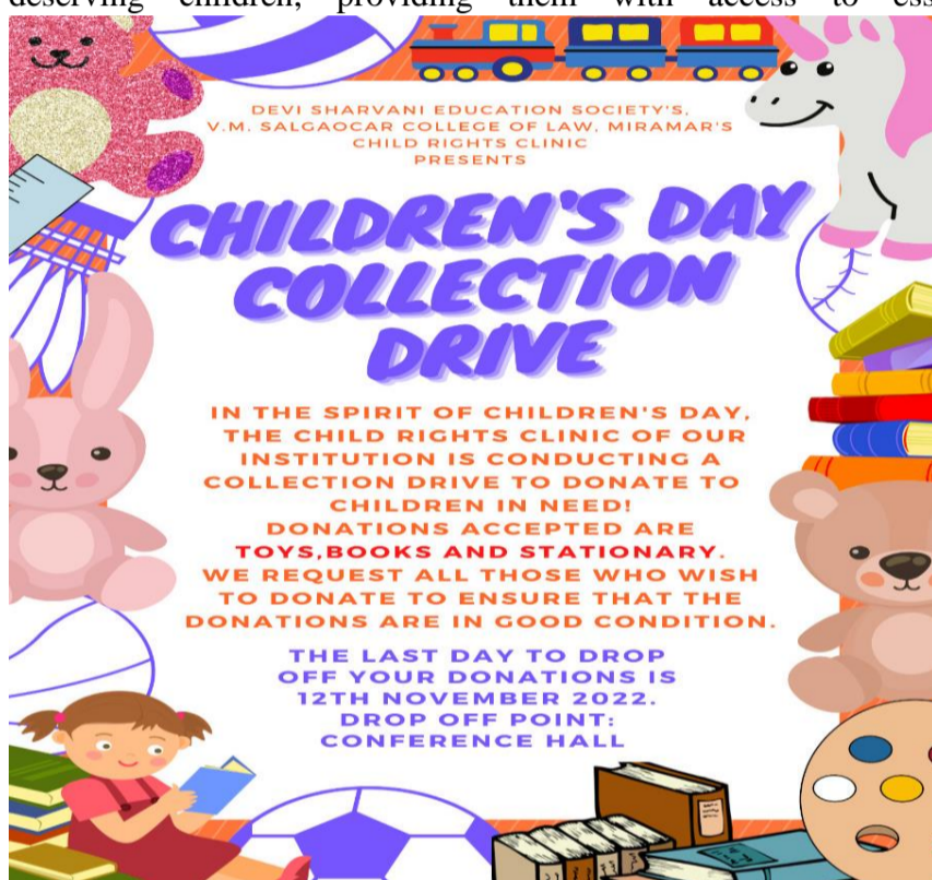
Figure 12 children's day collection drive poster

The collected items were handed over to a local charity organization, Overall, the Children's Day Collection Drive was a resounding success and helped in bringing a smile to the faces of many deserving children, providing them with access to essential stationery and toys.