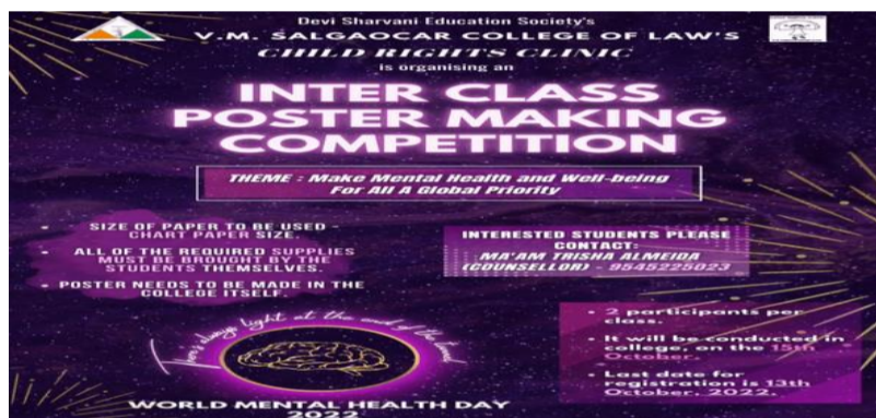
Figure 9 Poster making competition

The winners of the competition were announced on 18th October 2022, and they received certificates of appreciation for their efforts. The event was successful in achieving its objective of promoting mental health and wellbeing for all.