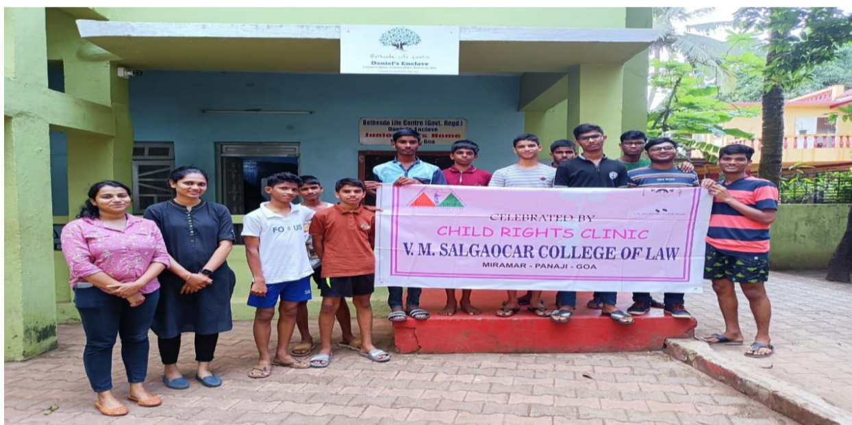
Figure 3 Child care institution: BETHESDA LIFE CENTRE. St.Cruz.

Along with awareness, the CRC member informed the participants about the functioning of the Child Rights Clinic.