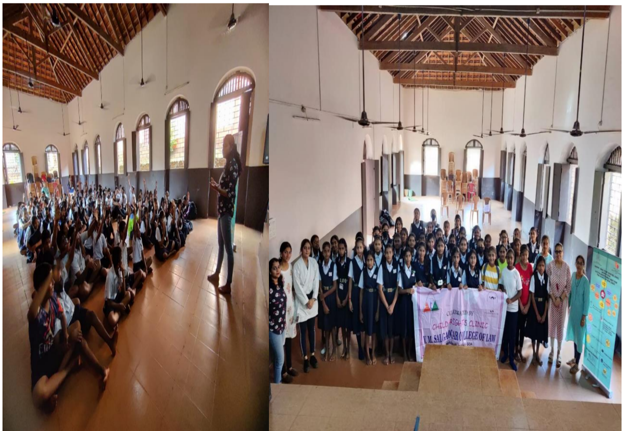
Figure 11 Awareness program at Sacred Heart School parra

Overall, the program was highly informative and interactive, and the students were engaged throughout the session. The Principal and the faculty staff appreciated the initiative and encouraged such programs to be conducted in the future as well.