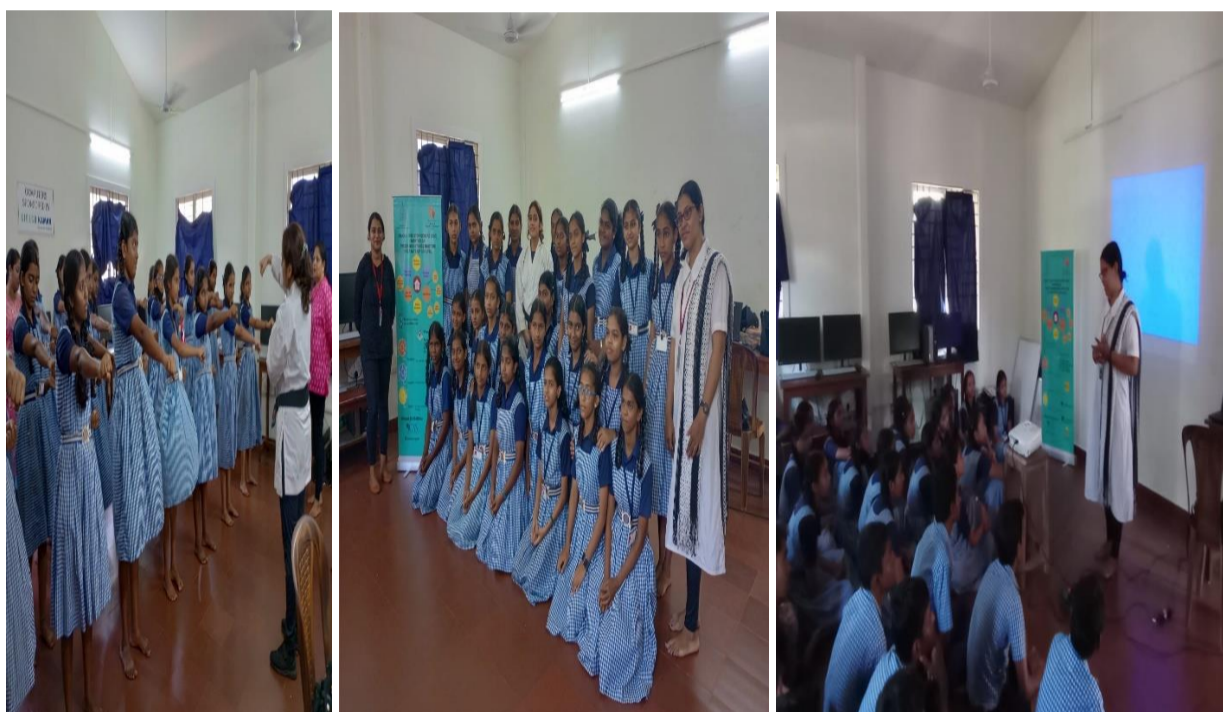
Figure 4 Program on Child Rights at St Dominic Savio High School, Calangute.

The Awareness Programme was a success and garnered a positive response from both the students and teachers present.