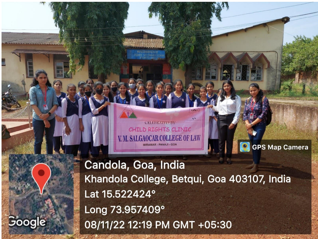
Figure 14 CRC Program at khandola