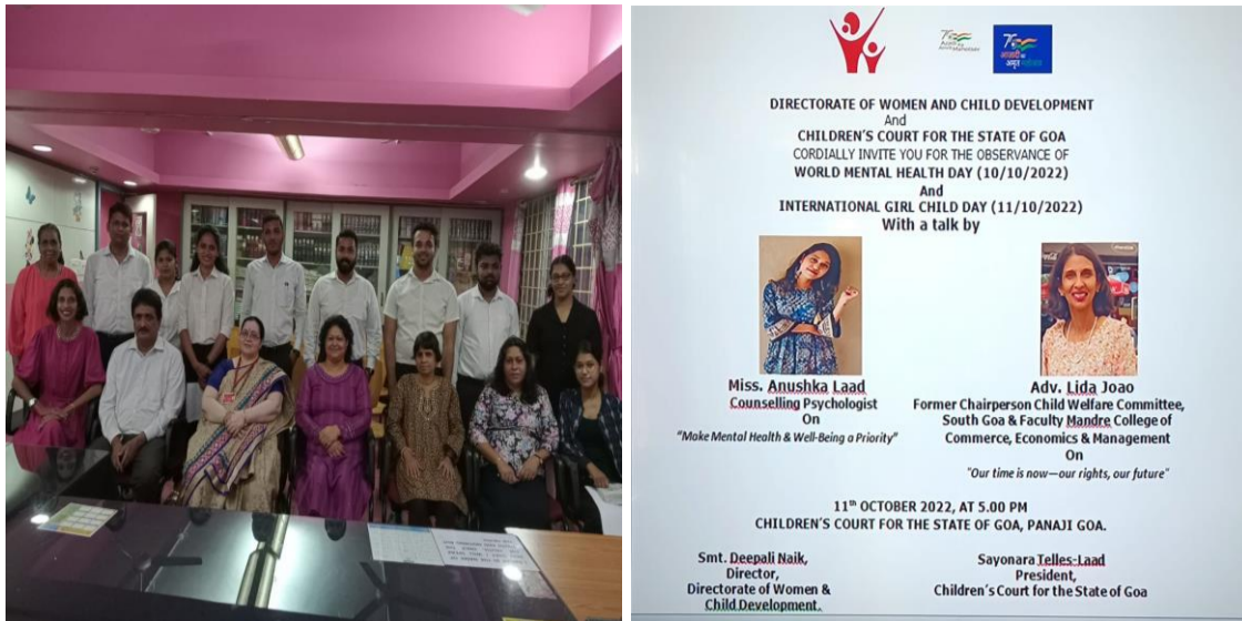
Figure 7 Observance of mental health day and international girl child day at children's court