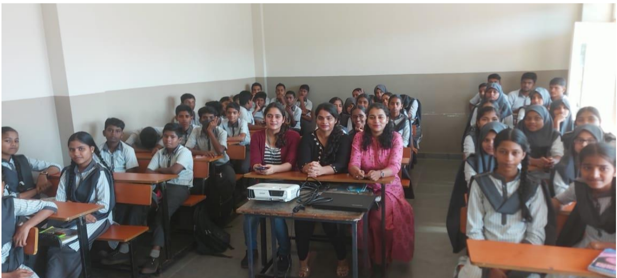
Figure 21 Figure 22 participants and the members of CRC and SCAN