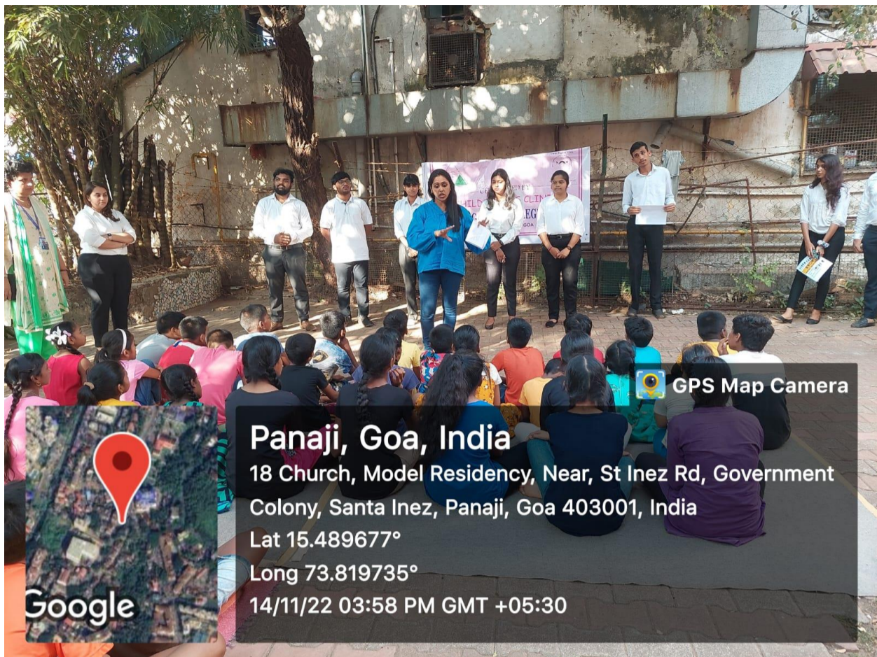
Figure 16 Childrens Day program at Hamara school