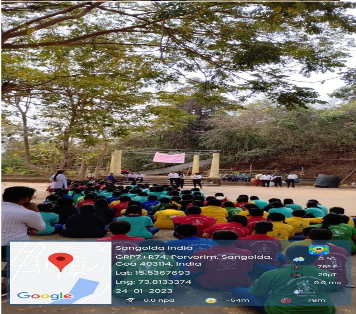
Figure 22 National girl Child day Celebrations

ACTIVITY 23- Representation of CRC at an Interactive Session for Nirma University Held On: 10 th March 2023