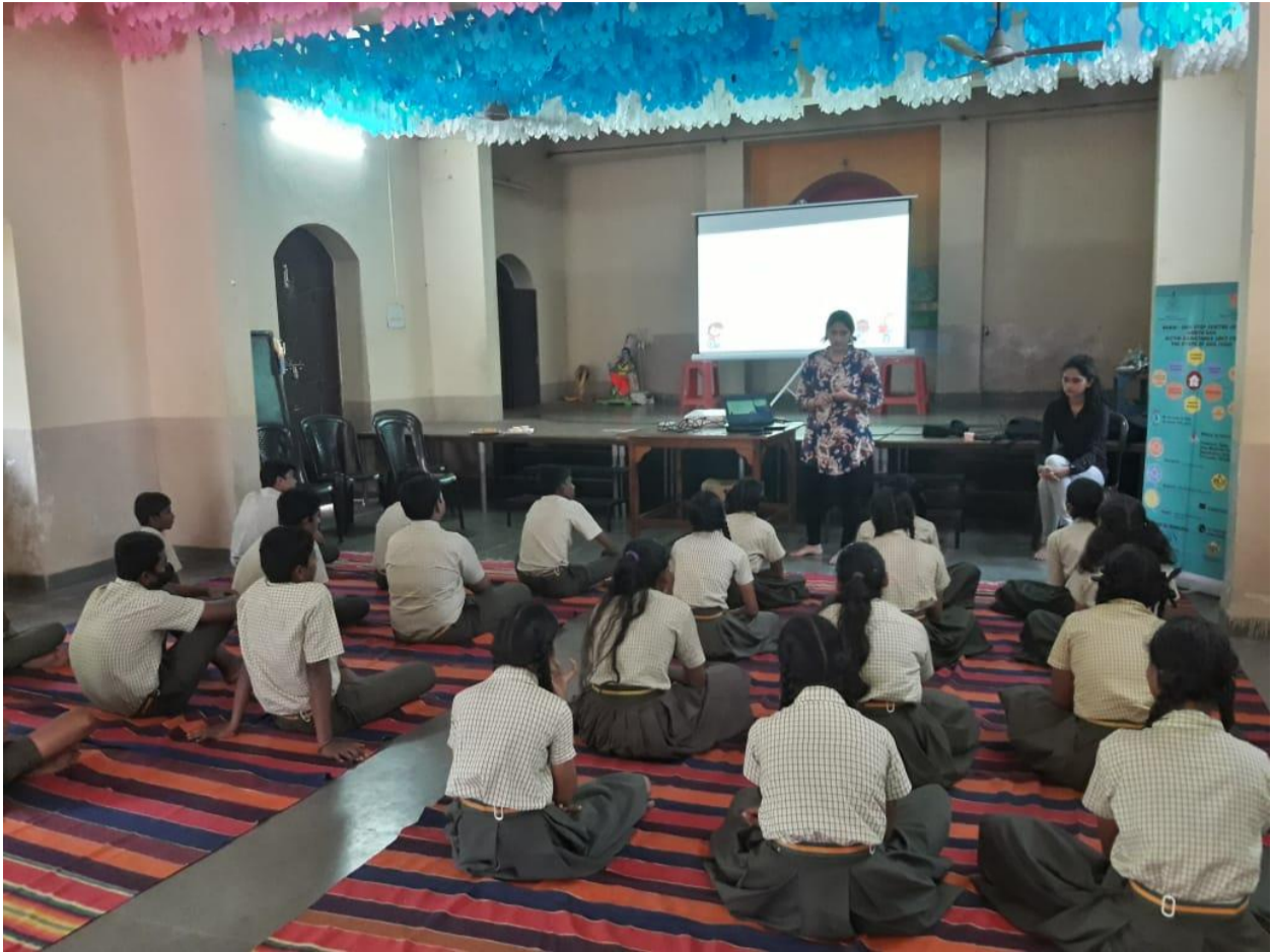
Figure 19SCAN WITH CRC PROGRAM 😊@Popular English High School -Goavelha