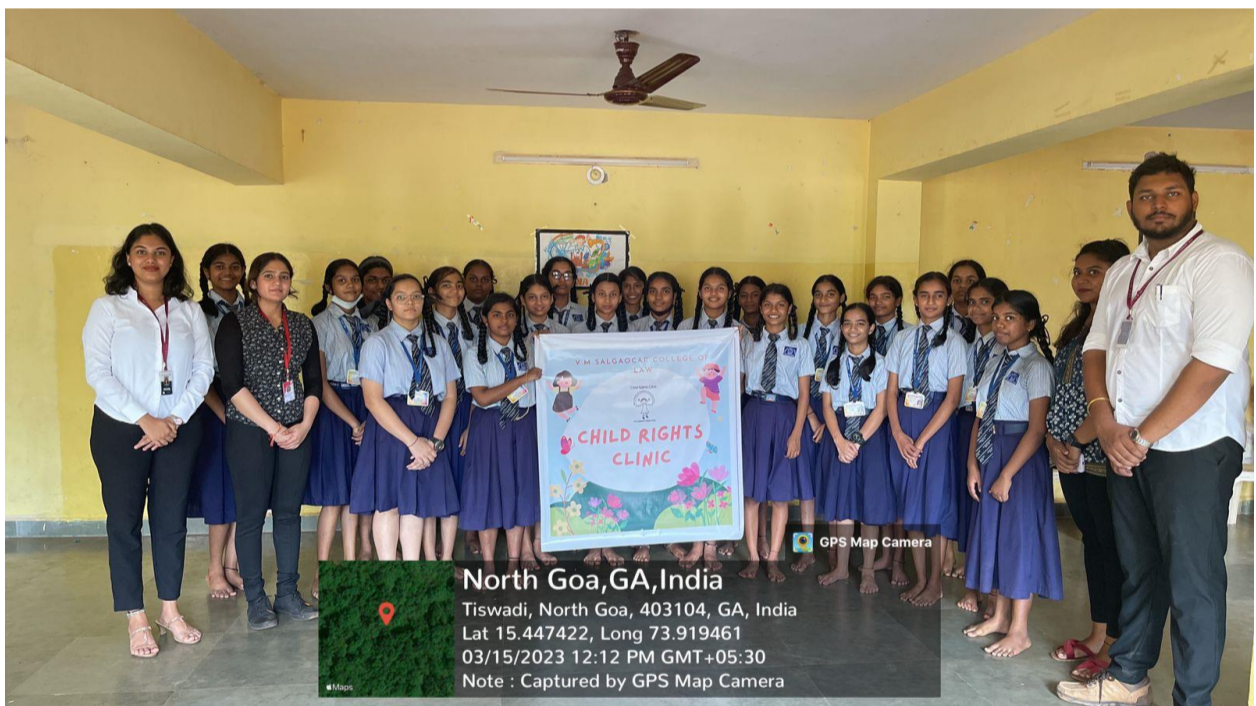
Figure 24 Awareness program at Azmane School Neura.