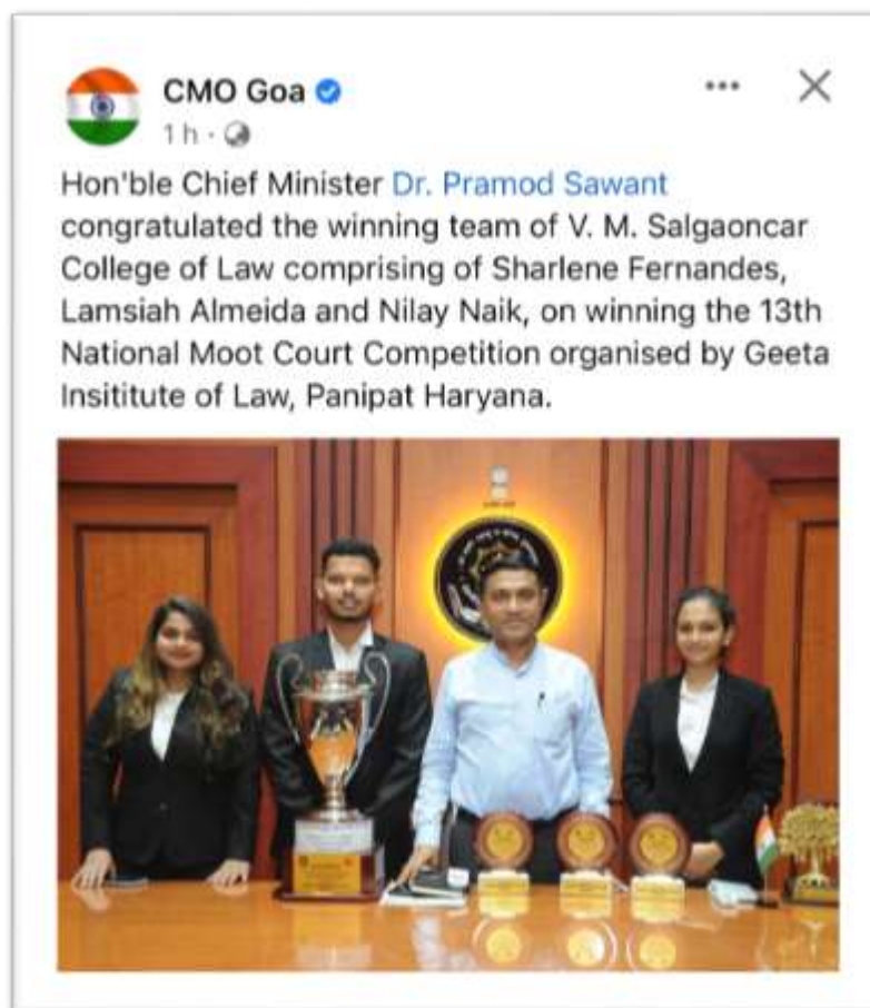
Hon'ble Chief Minister of Goa, Dr. Pramod Sawant congratulated the winners https://twitter.com/goacm/status/1635330814627160065 (March 13, 2023)