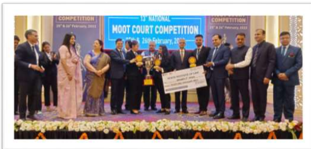
Prize distribution ceremony-The VMSCL team receiving the Prize money Cheque and Trophy at the hands of Hon'ble Shri. Justice Dinesh Maheshwari, Judge, Supreme Court of India,

The performance in final was judged by Supreme Court Judge among others. The team was highly appreciated by Supreme Court Judge present for the final round. The Moot Court Competition comprised of 48 teams from different Law Colleges and Universities across India.