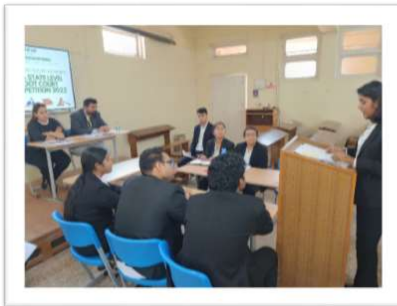
Preliminary round Proceedings in the Court room.

The Preliminary and Quarter- final rounds were held in the two respective Colleges. It was decided that top two teams will qualify for the Semi-Finals in the Premises of G.R.Kare College of Law, Margao, on 22 nd October, 2022. Participants were divided into 8 teams comprising of two mooters and one researcher. The Preliminary rounds were conducted in four court rooms in accordance with the rules of the Competition.