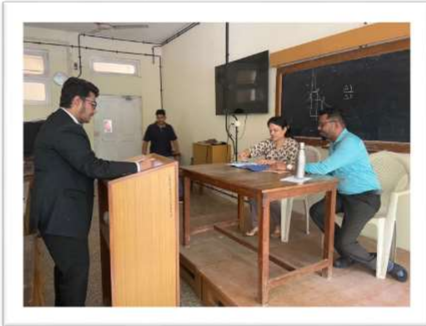
Moot Court Society selection round held on 08/09/2022

A total number of 68 students were chosen to be part of the Moot Court Society for the academic year 2022-2023.