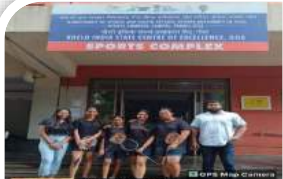
Participated in Badminton (Women) at Inter-Collegiate Championship