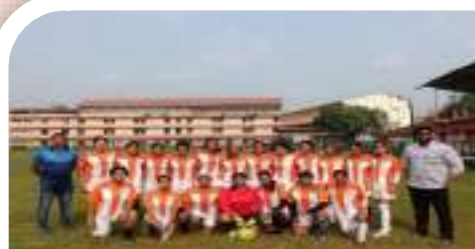
Participated in Football at Inter-Collegiate Championship