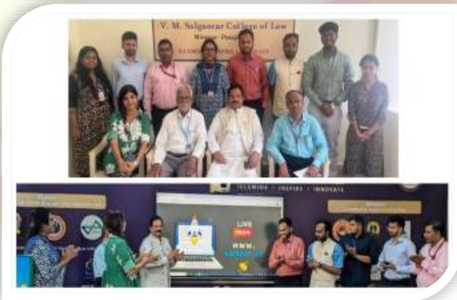
Launching of The CPL Website by Union Minister Shri Shripad Naik