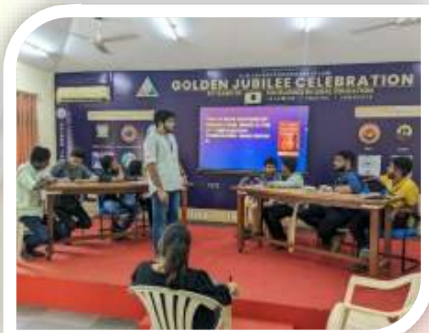
Empower the Vote: Quiz on Voter Awareness

Our club is a vibrant community of avid learners and quick thinkers, united by our passion for trivia, facts, and friendly competition. Whether you're a seasoned quizzier or just looking to sharpen your wits, our club offers a platform to explore diverse topics, exercise your mental prowess, and forge lasting friendships.