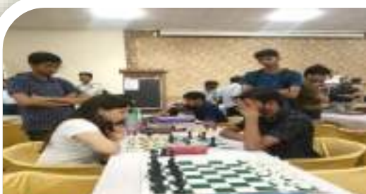
Participated in Chess at Inter-Collegiate Championship