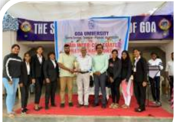
Semifinalist in Basketball at Inter-Collegiate Championship