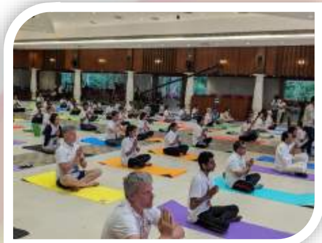
Yoga day celebration at Raj Bhavan

The event commenced with an inaugural ceremony presided over by the Governor of Goa. Dignitaries, G20 Delegates, Union Ministers, Yoga Practitioners, and Students of VMSCL participated in this event. Cells attended this event.