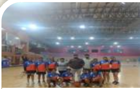
Participated in Table Tennis at Inter-Collegiate Championship