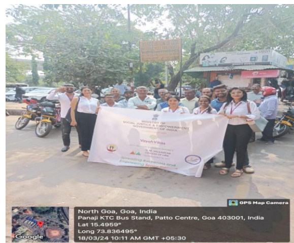
North Goa, Goa, India Panaji KTC Bus Stand, Patto Centre, Goa 403001, India Lat 15.4959° Long 73.836495° 18/03/24 10:11 AM GMT +05:30