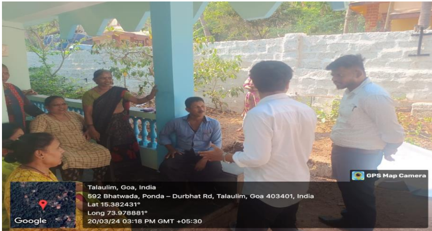
Talaulim, Goa, India 592 Bhatwada, Ponda – Durbhat Rd, Talaulim, Goa 403401, India Lat 15.382431° Long 73.978881° 20/03/24 03:18 PM GMT +05:30