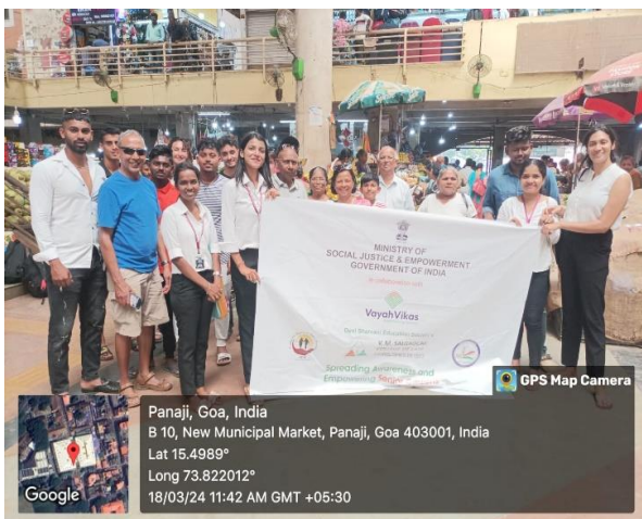
Panaji, Goa, India B 10, New Municipal Market, Panaji, Goa 403001, India Lat 15.49889° Long 73.822012° 18/03/24 11:42 AM GMT +05:30