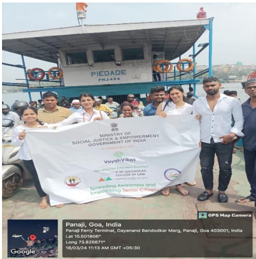
Panaji, Goa, India Panaji Ferry Terminal, Dayanand Bandodkar Marg, Panaji, Goa 403001, India Lat 15.501806° Long 73.825671° 18/03/24 11:13 AM GMT +06:30