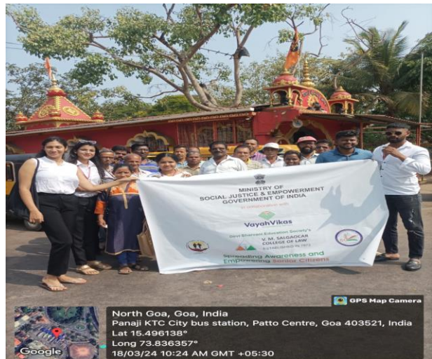
North Goa, Goa, India Panaji KTC City bus station, Patto Centre, Goa 403521, India Lat 15.496138° Long 73.836357° 18/03/24 10:24 AM GMT +05:30