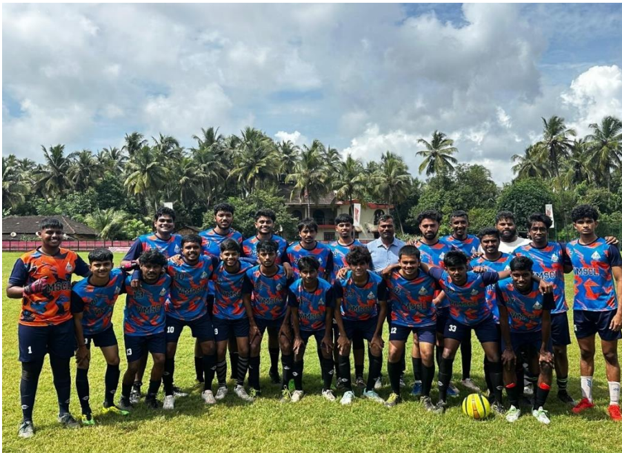
Football Men's Team