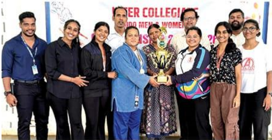
The winners pose with the trophy alongside officials.