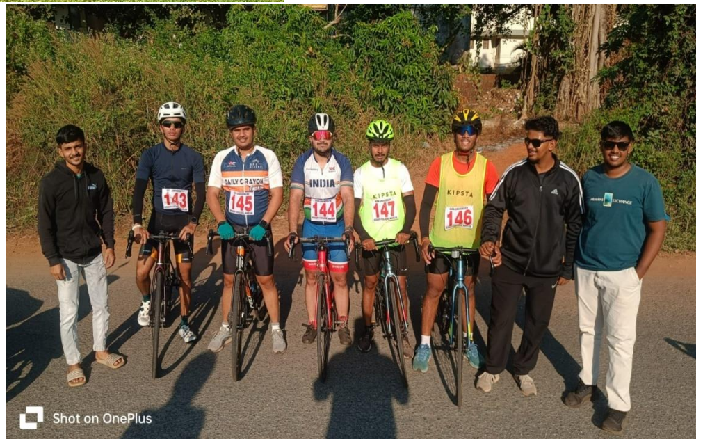
Cycling Men's Team